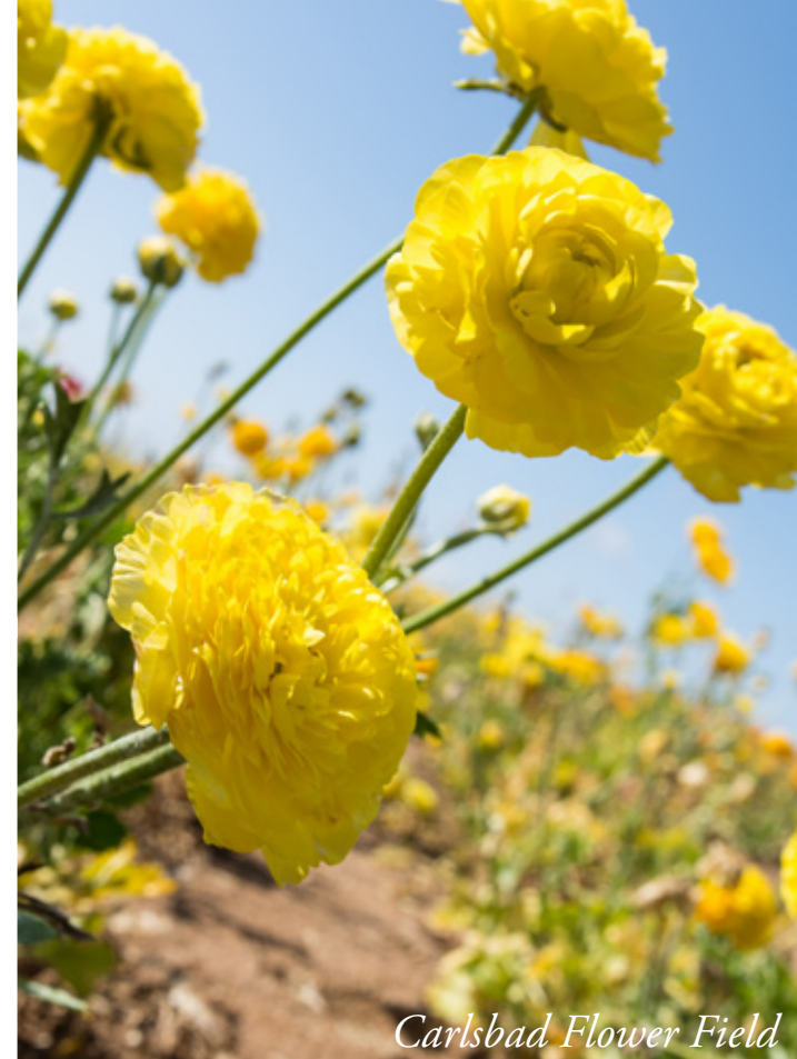
Carlsbad Flower Field