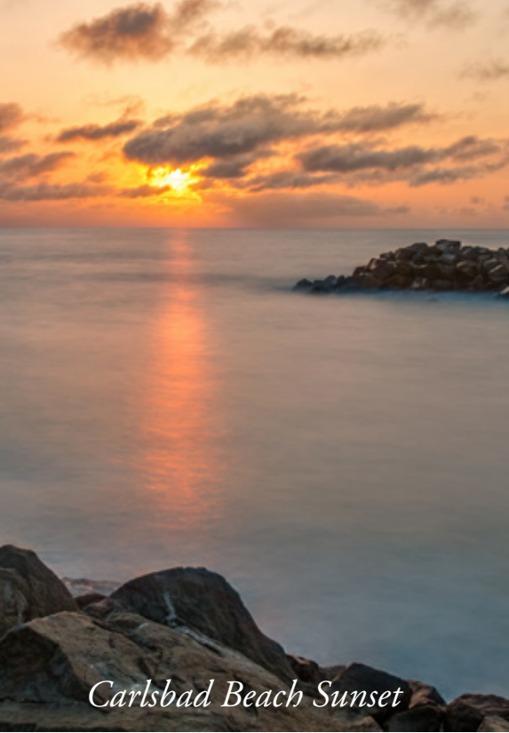
Carlsbad Beach Sunset