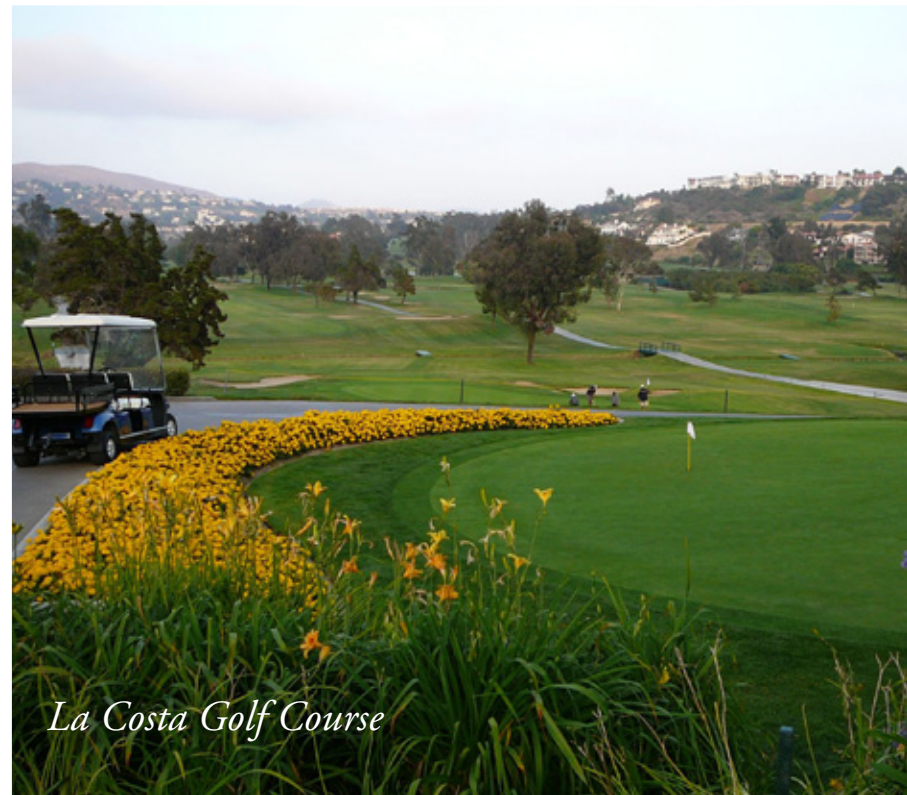
La Costa Golf Course

Home to ViaSat (3,300 employees), TaylorMade-Adidas Golf Company, La Costa Resort & Spa