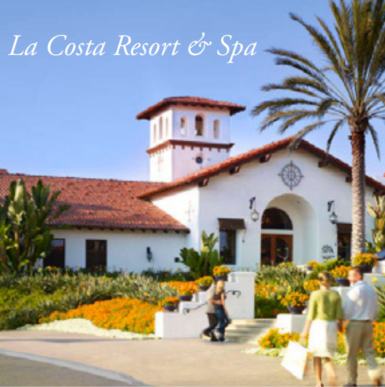
La Costa Resort & Spa