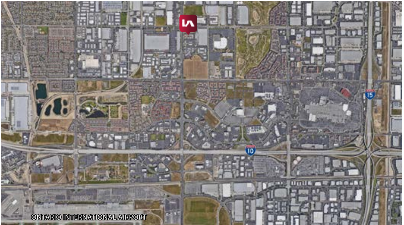
ONTARIO INTERNATIONAL AIRPORT