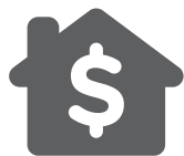
Average HH Income