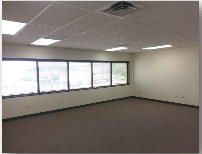
Common Area/Kitchen/Break Room on 2nd Floor