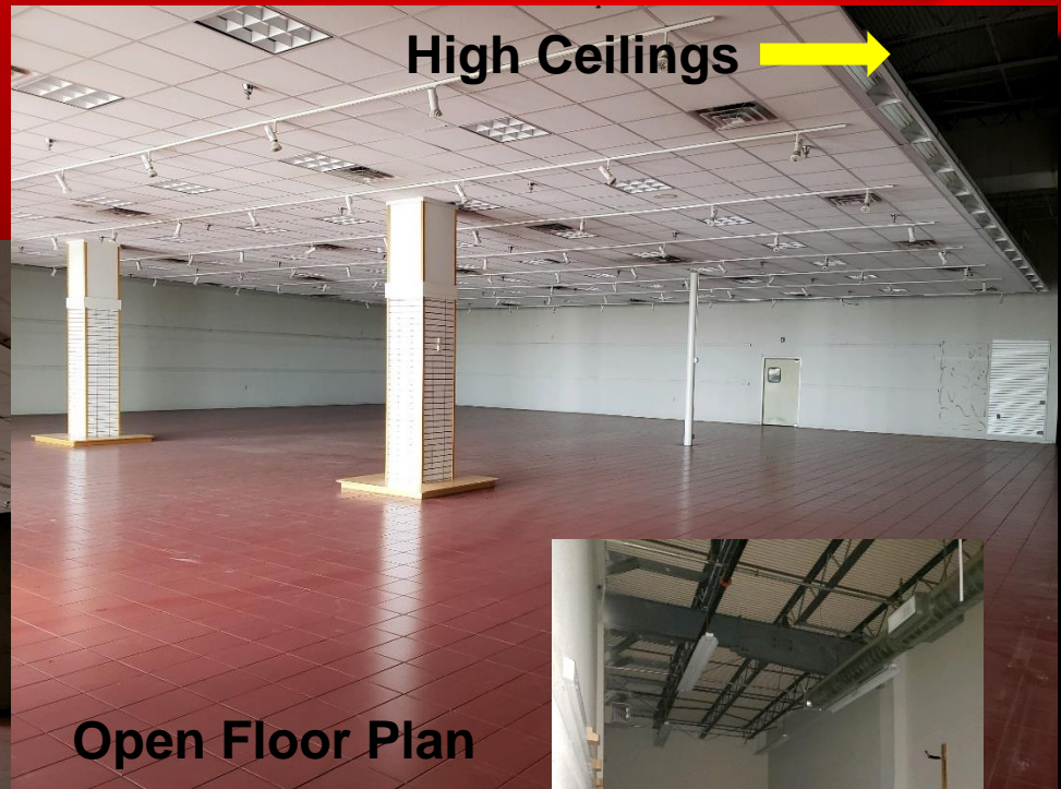
Open Floor Plan