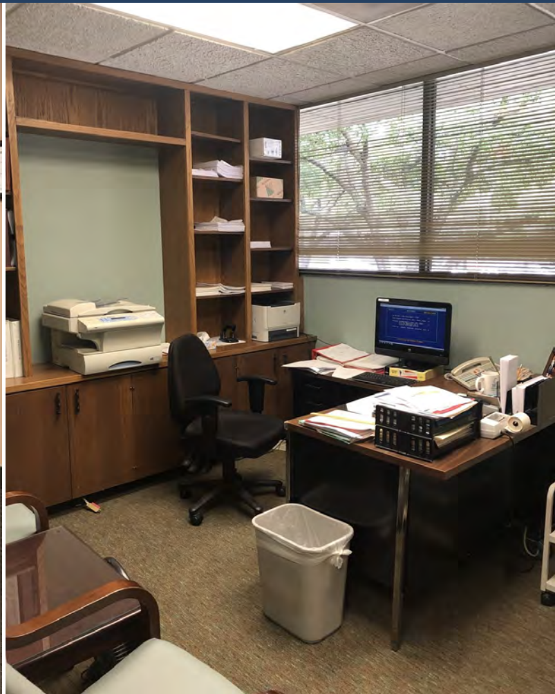
Suite 105 Exam Room and Private Office (above) & Building Amenities (below)