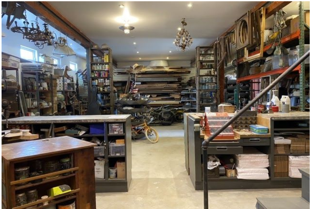
Above is interior of Rear Building Below is Courtyard between front and back buildings