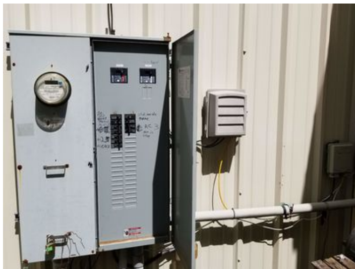
Electrical Service Panel