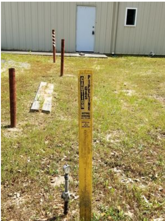
Natural Gas Available