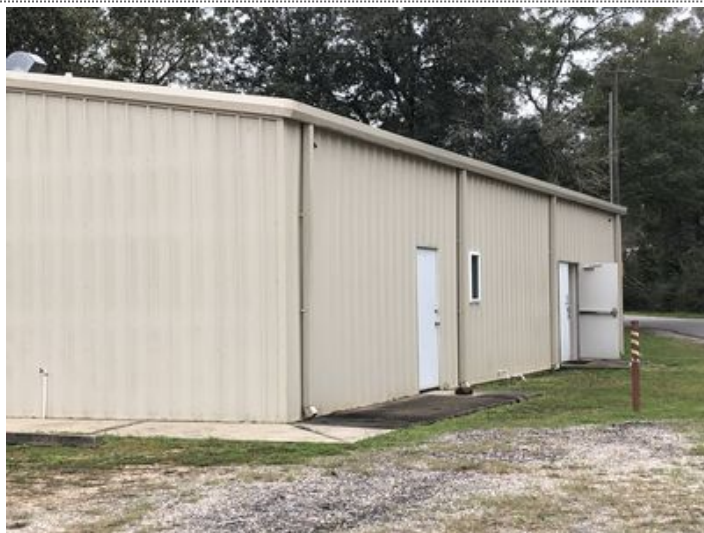
Right Side Exterior