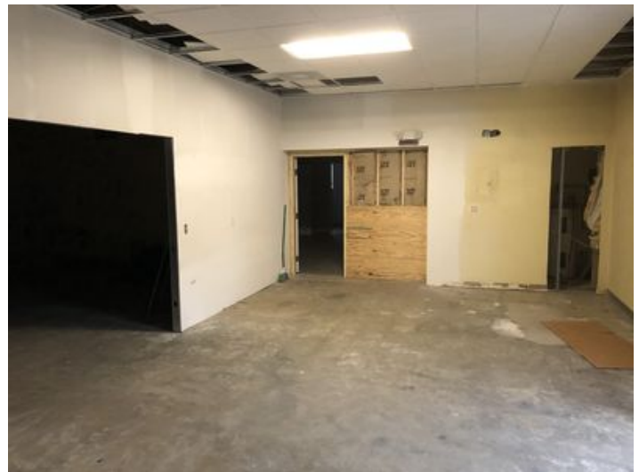
Interior 3 Partial Build Out