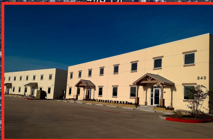
LAWRENCE BUSINESS PARK