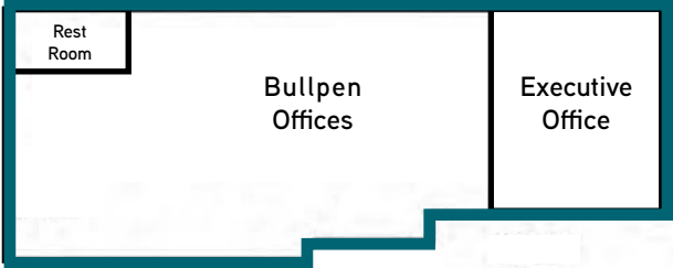
Second Level Mezzanine