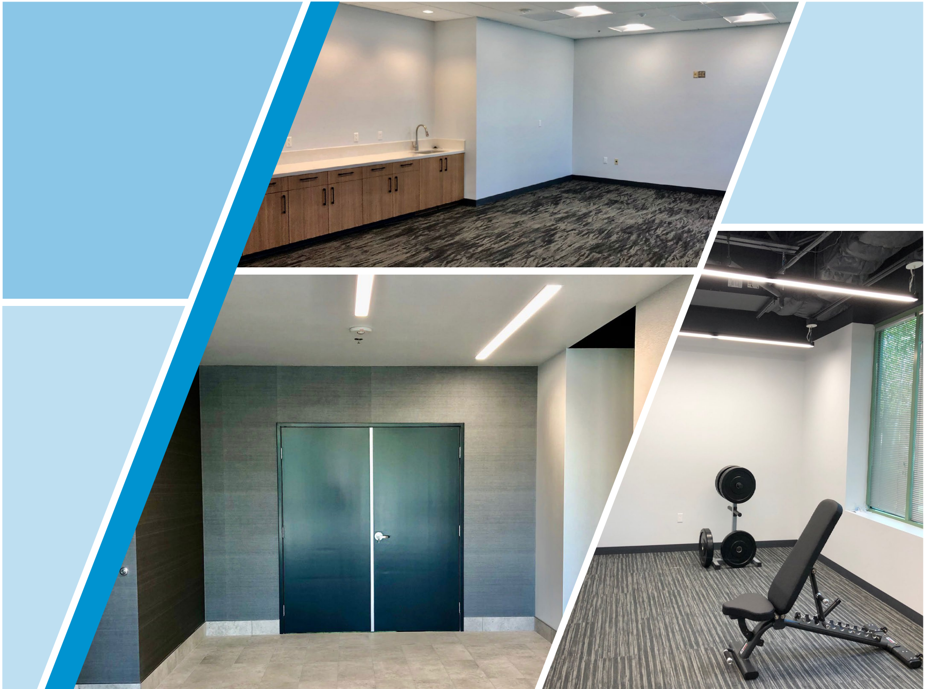
Clockwise From Top: Shared Conference Room, Gym, and Updated Lobby