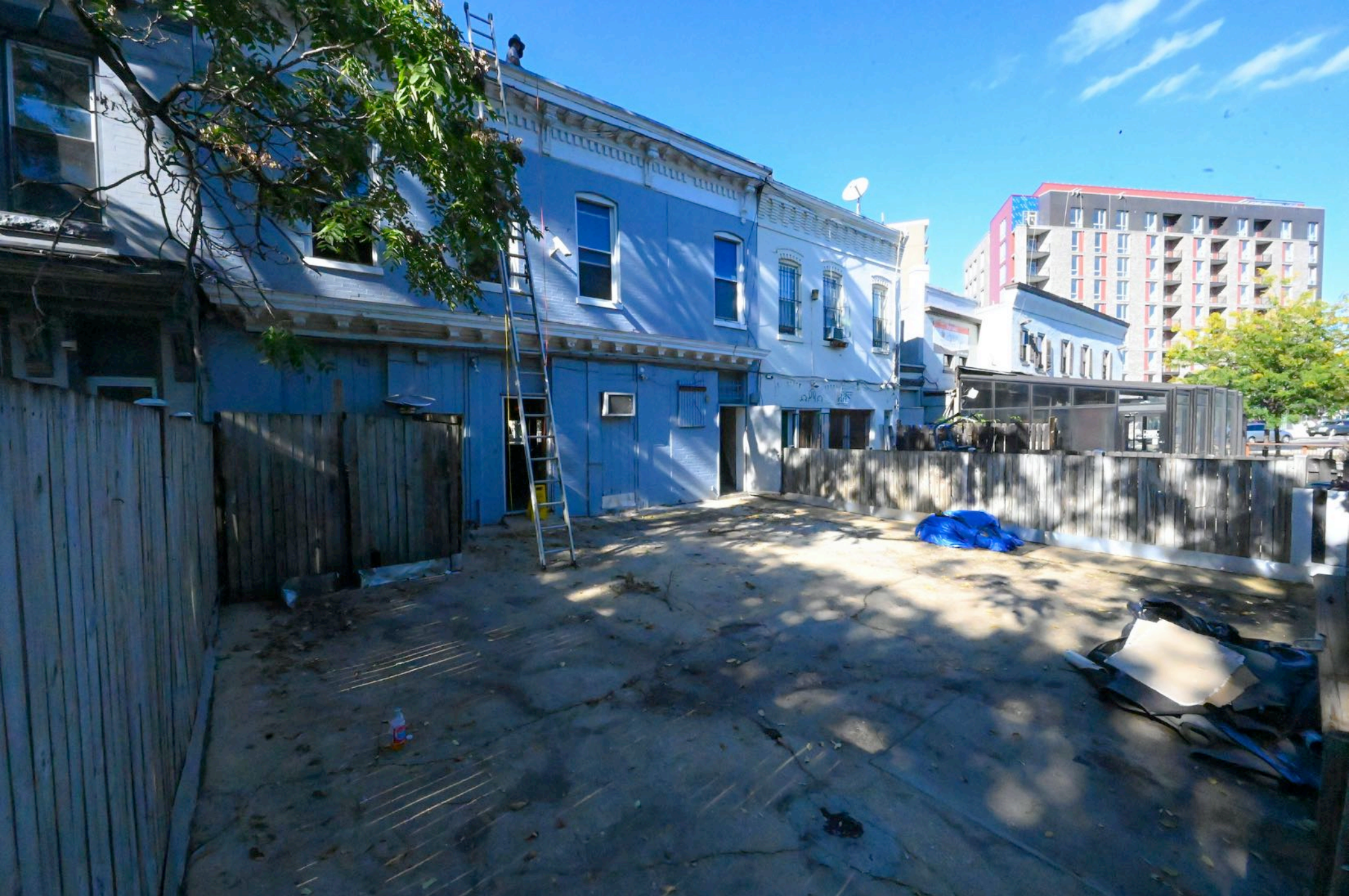
1427 H Street, NE, Washington, D.C.