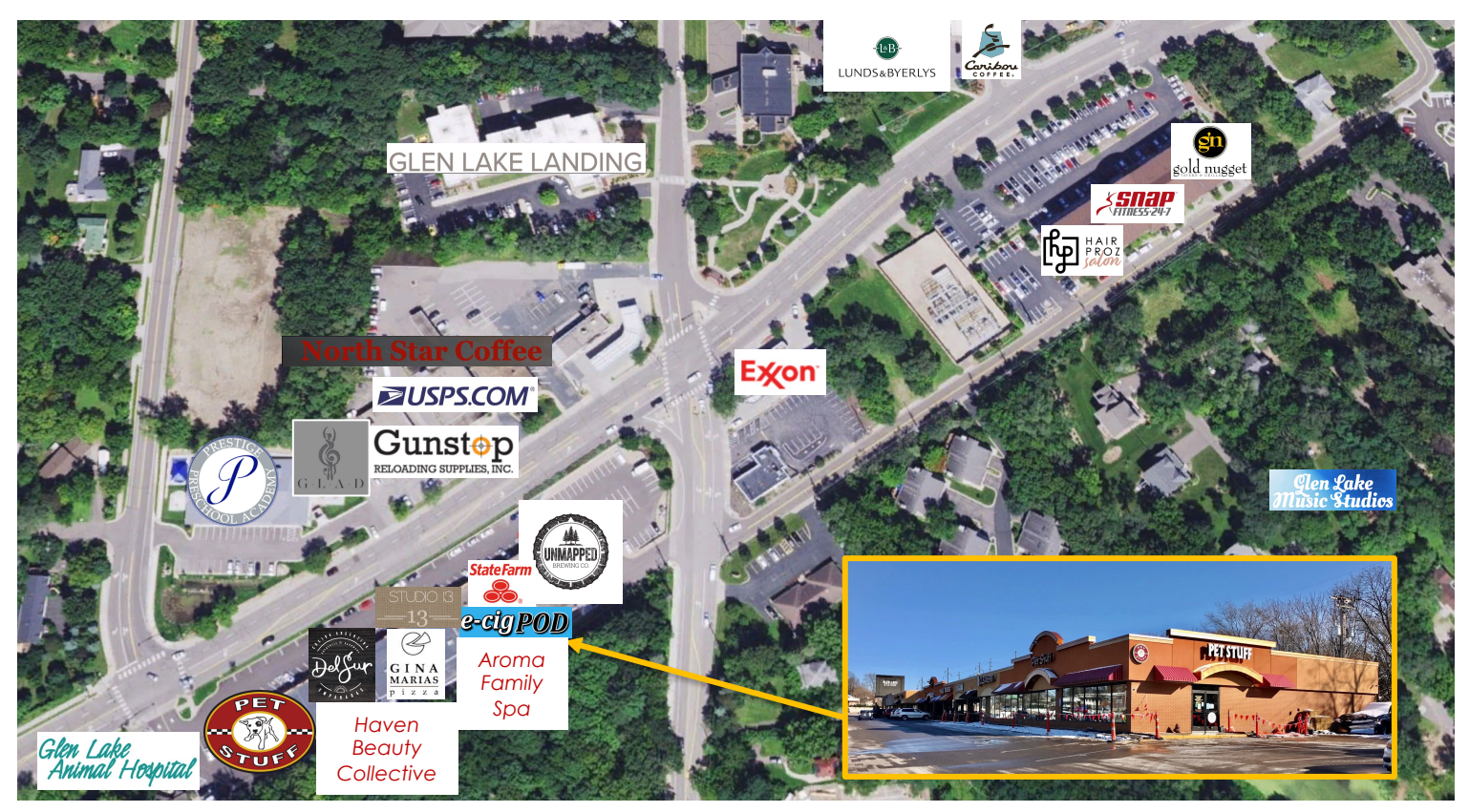
This information is accurate as of the date of printing and is subject to change without notice. All information is deemed accurate, but cannot be guaranteed.