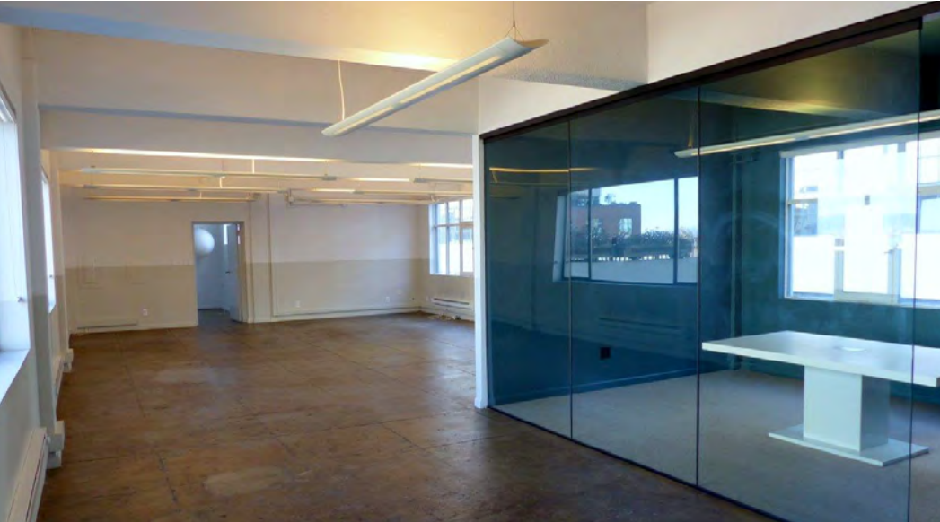
Suite 4D Conference Room #1 and Open Area