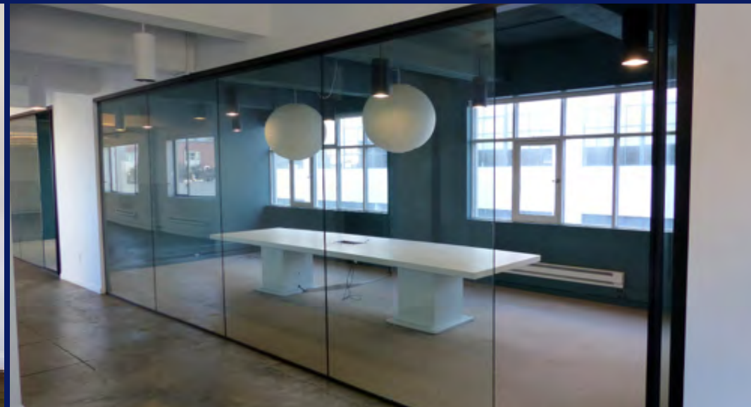
Suite 4D Conference Room #2