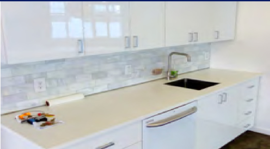
Suite 4D Kitchenette