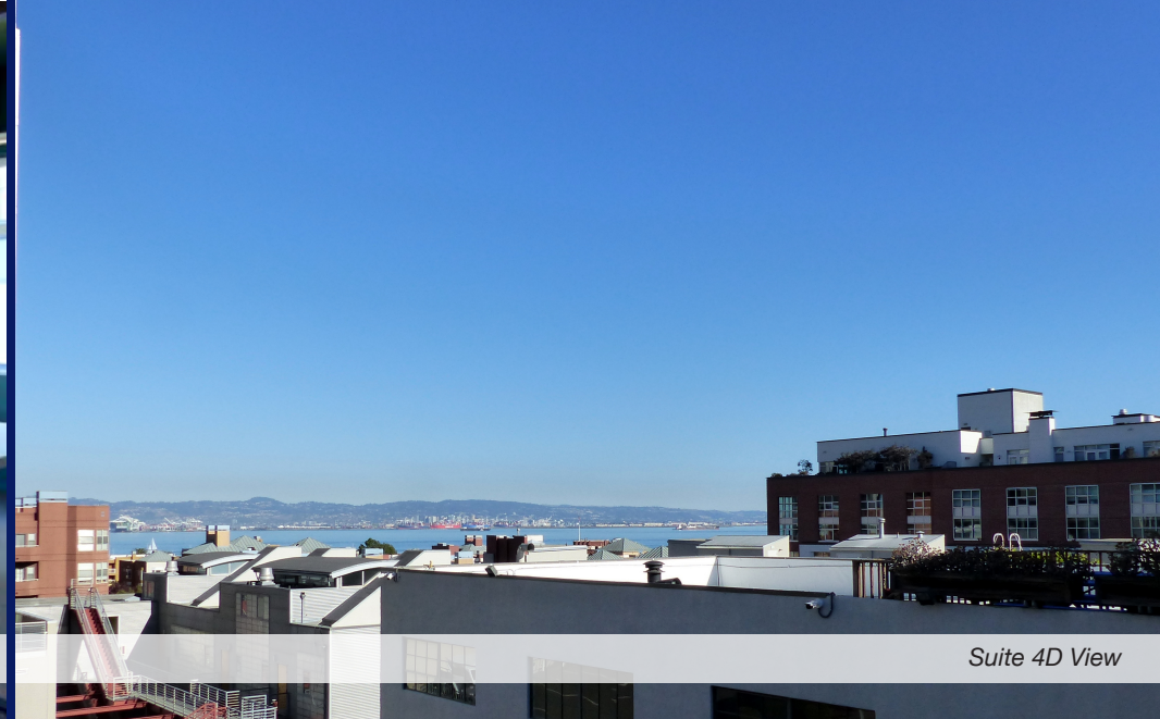
Suite 4D View