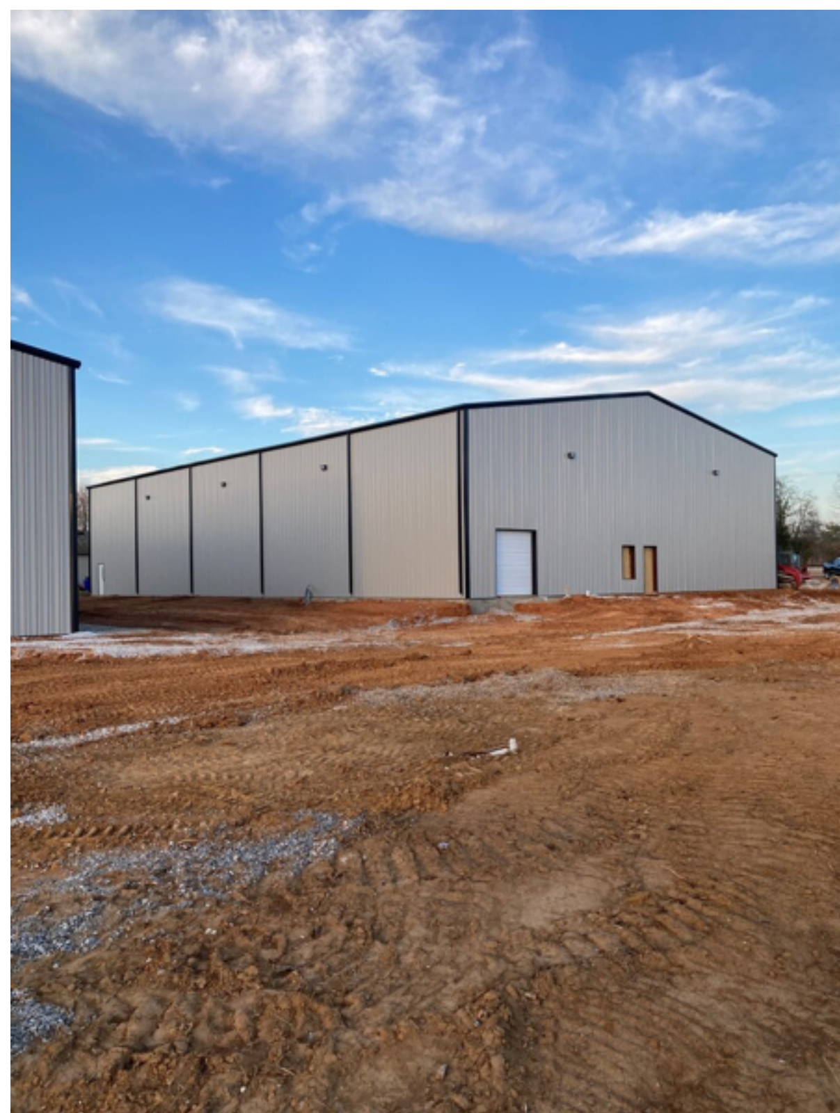
Building C 11-4-4