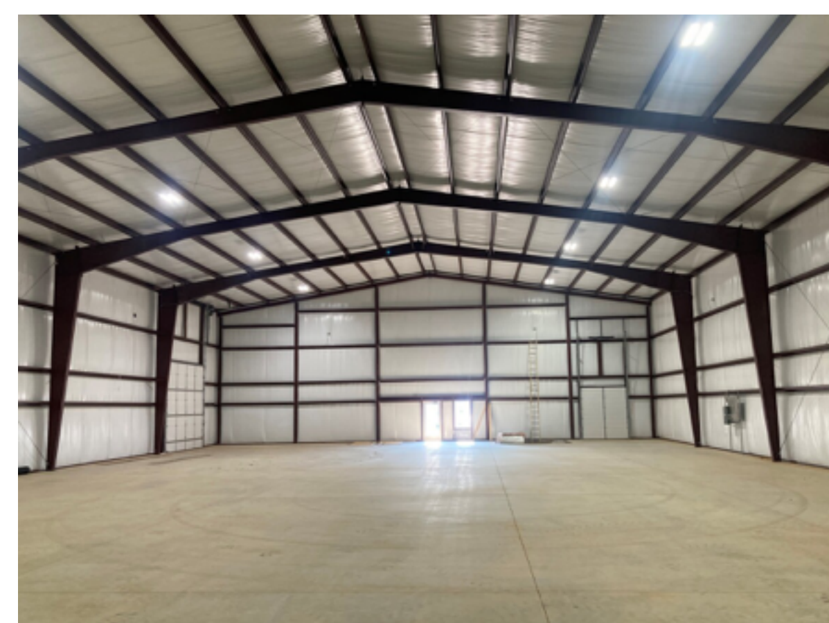
Building C 12-20-3