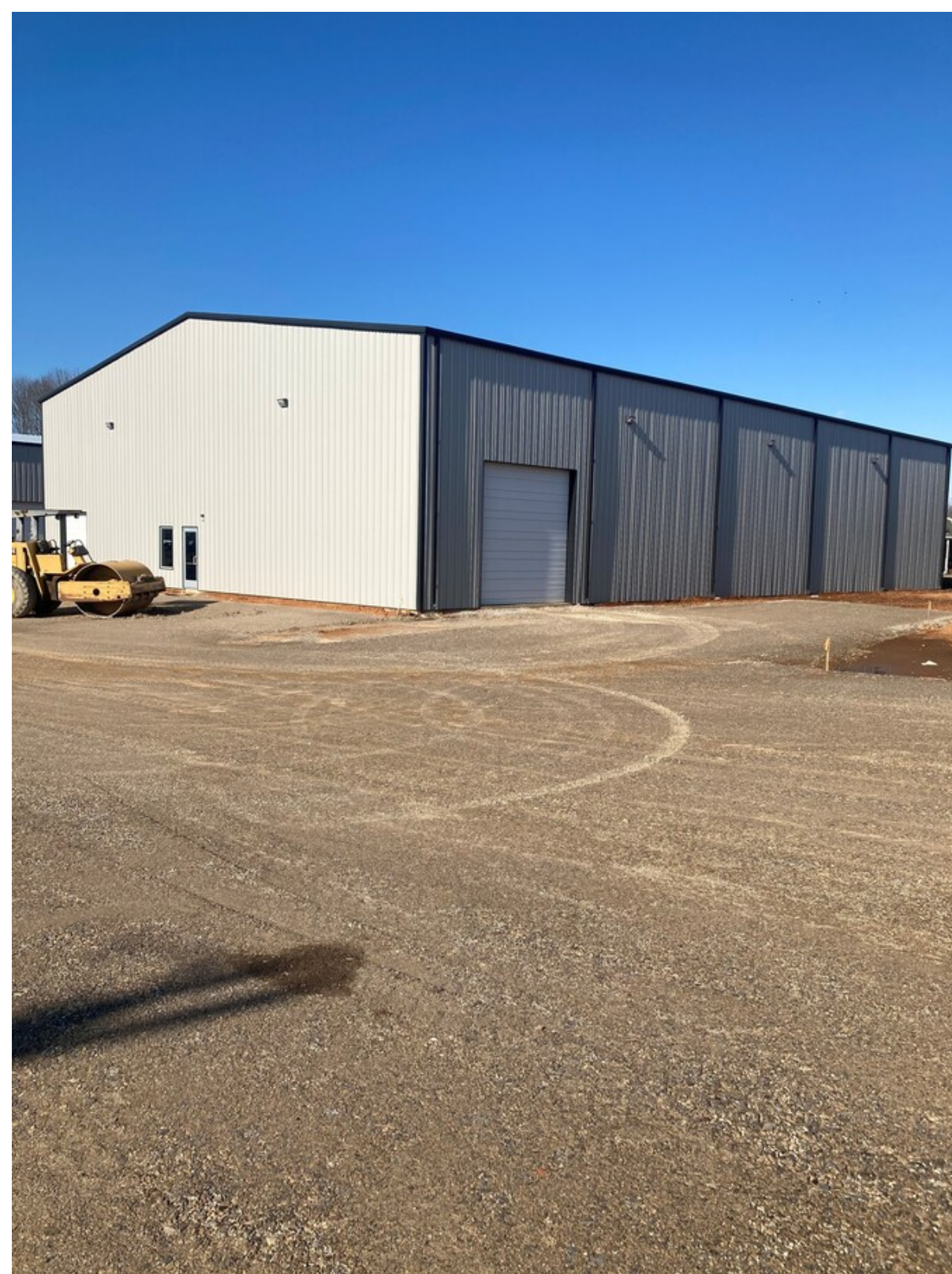
Building C 12-20-2