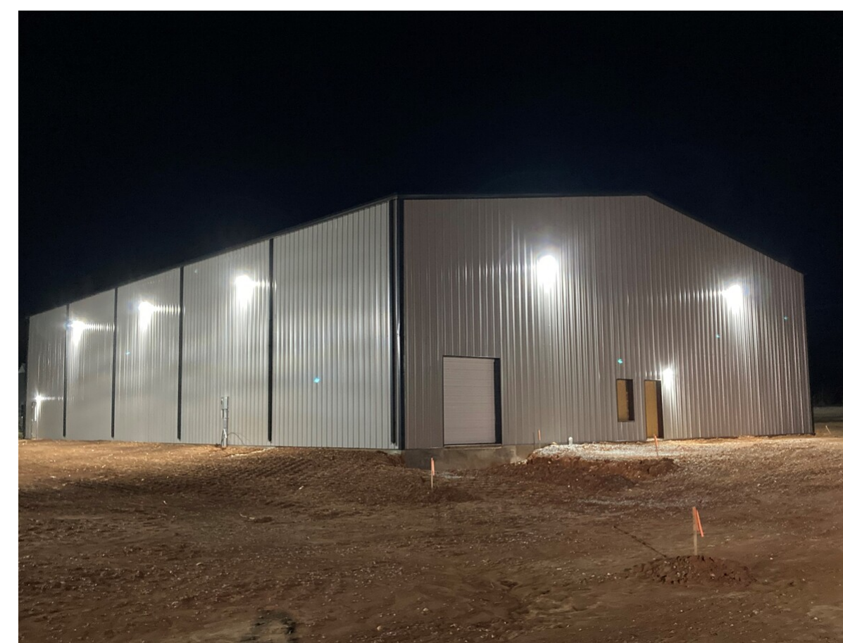
C-1 on 11-22